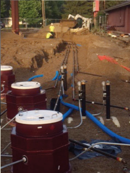
Tank Pipe Run - 2" Omega Flex pipe w/4" ducting

The ease of installing DoubleTrac into chase piping saves the end user money because they do not need to remove all of the concrete and or they can just use the existing chase piping.