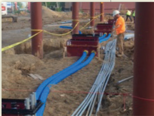
Dispenser Pipe Run - 1.5" Omega flex pipe w/4" ducting