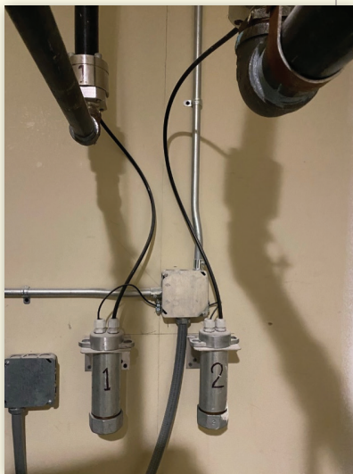
Comfort Inn, Queens, NY