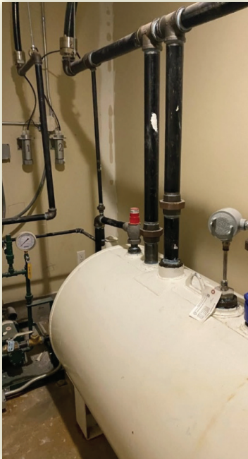
Mechanical Room AST and Fuel Sensor Housings.