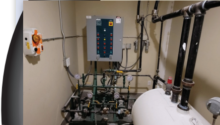
DoubleTrac® Continuous Monitoring System P/N# UGF-CM-KIT (Alarm Controller) mounted on the wall. The Alarm Controller's output relays are tied into the duplex pump set to shut it off in the event of a detected leak.

OmegaFlex® offers a team of in-house engineers dedicated to assist with piping layouts and answering technical questions about DoubleTrac® piping system. OmegaFlex® offers no cost training and certification of new installers.