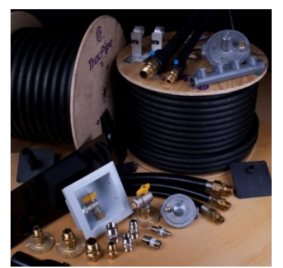
TRACPIPE® COUNTERSTRIKE® TUBING